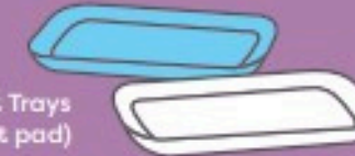
Foam Meat Trays (remove absorbent pad)