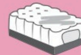
Outer Bags and Overwrap