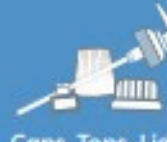
Caps, Tops, Lids and Pumps