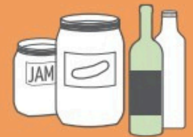
Non-deposit Glass Bottles and Jars (clear and coloured)