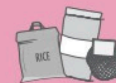
Woven Plastic Bags

For a detailed list of accepted flexible plastics visit: SKRecycles.ca/Materials