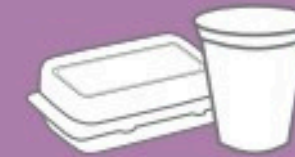
Foam Containers and Cups