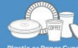
Plastic or Paper Cups, Plates, Bowls and Lids