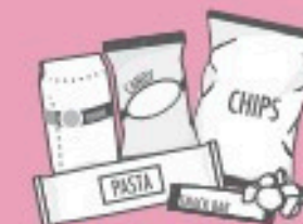
Crinkly Wrappers and Bags