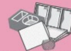
Protective and Squishy Cushion Packaging