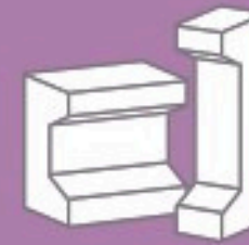
Foam Cushion Packaging used to protect electronics, etc.

✔ Empty and rinse ✔ Remove labels, tape and paper