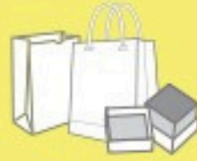
Paper Bags and Boxes