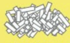
Shredded Paper (contain in paper bag or box first)