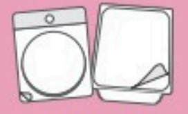
Flexible Packaging with Plastic Seal