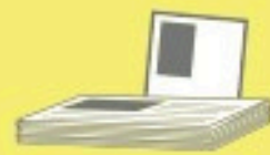
Newspapers, Inserts and Flyers