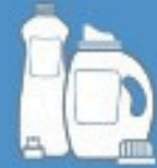
Plastic Bottles, Jars and Jugs