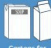
Cartons for Soup, Cream, etc.