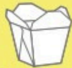
Paper Takeout Containers