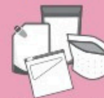
Zipper-lock and Stand-up Pouches